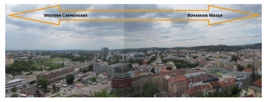
Fig. 4 A view from Denis Gardens: the difference between two main geological units of the Czech Republic can be observed here: pronounced relief of Bohemian Massif (old and resistant rocks, e.g. metabasalts, granodiorites or

From the lookout in Denis Gardens, it is possible to observe the difference between two European-scale geologic provinces: Bohemian Massif and Western Carpathians (Fig. 4). The obelisk is built of coral marble from Šumbera and it is possible to find some fossils here.