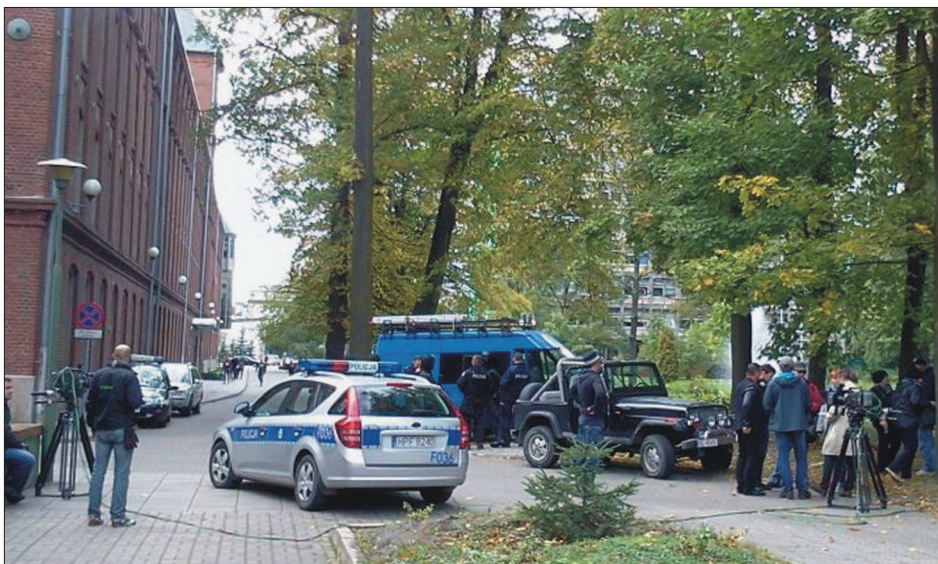
Fig. 4: The making of Komisarz Alex , 4 th season.

Newsweek magazine (Polish edition), the first episode of Komisarz Alex was watched by over five million viewers. In this way, the story about the adventures of a Łódź policeman helped by a dog beats popular shows presented on other TV channels at the same time: X factor and Battle of the Voices (Szadkowska, 2012).