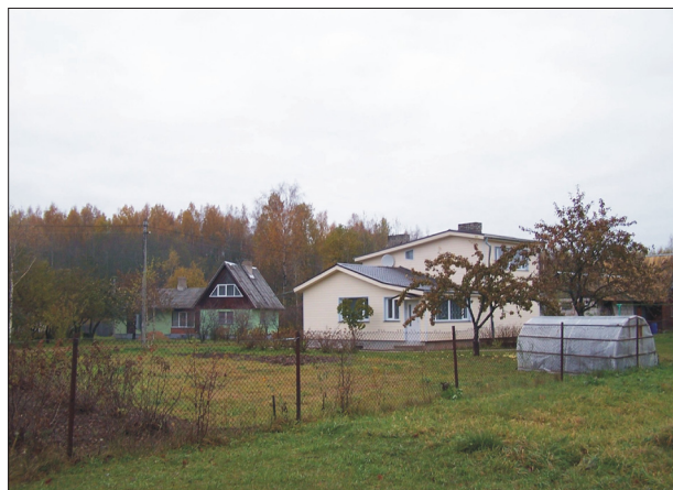
Fig. 1: Post-summurban milieux

This article focuses on how residents and local municipality officials relate to planning issues in post-summurbia. We chose a research strategy built on qualitative interview methods, as we view these as essential to provide personal insights into the ideas, needs and visions of our informants towards permanent residence in post-summurbia. While mapping out the planning arena from the perspectives of local planning officials and post-summurban residents, the article gives special recognition to the lack of rules and principles that have emerged. In contrast, principles are a fundamental feature of planning as a common governance practice (cf. Healey, 2009). In our discussion of the case studies, we view the absence of proactive planning as a form of 'spontaneous