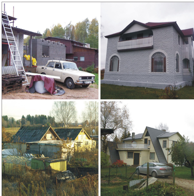
Fig. 2: Examples of the visual impressions from post-summurbia