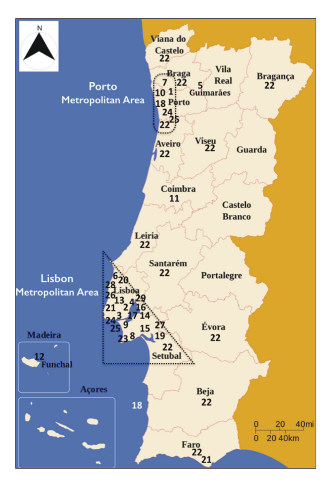
Fig. 1: Location of the 29 UA initiatives in Portugal Legend: (1) Horta à Porta - LIPOR. PMA, (2) Parques Hortícolas de Lisboa, (3) Hortas de Cascais, (4) Horta AVAAL, Lisboa, (5) Hortas de Guimarães, (6) Hortas Urbanas de V. Franca Xira, 7) Hortas Hospital C. Ferreira, Porto, (8) Parque Hortícola da Quinta da Várzea, Sesimbra, (9) Hortas de S. João, Almada, (10) Hortas de Vila Nova de Gaia, (11) Horta do Ingote, Coimbra, (12) Hortas do Funchal, Madeira, (13) Hortas Cova da Moura, Amadora, (14) Hortas Bairro Boavista, Lisboa (15) Hortas Urbanas da Moita, (16) Horta da Caixa G.D. Lisboa, (17) Projeto Horta Integrada, Lisboa, (18) Hortas da Fundação de Serralves, Porto, (19) Da quinta para o prato, Palmela, (20) Hortas Empresariais, Loures, (21) Horta do Baldio, Lisboa, (22) Programa PROVE, Portugal, (23) Cabaz do Peixe, Sesimbra, 24) Fruta Feia. LMA and PMA, (25) Biovivos,(26) Projeto Semear, Lisboa, (27) Horta Prisão de Setúbal, (28) Cercica de Cascais, (29) Loja Produtos Rurais, Lisboa

Healthy micro greens (case 25) have largely expanded and are being distributed in various cities as high quality products. They are a unique example of diversification of UA products towards new market niches. Another original initiative is the distribution of local fish (case 23).