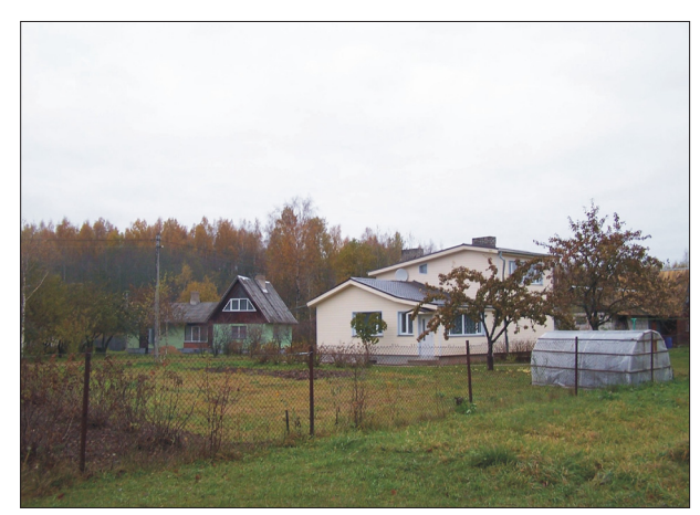
Fig. 1: Post-summurban milieux

This article focuses on how residents and local municipality officials relate to planning issues in post-summurbia. We chose a research strategy built on qualitative interview methods, as we view these as essential to provide personal insights into the ideas, needs and visions of our informants towards permanent residence in post-summurbia. While mapping out the planning arena from the perspectives of local planning officials and post-summurban residents, the article gives special recognition to the lack of rules and principles that have emerged. In contrast, principles are a fundamental feature of planning as a common governance practice (cf. Healey, 2009). In our discussion of the case studies, we view the absence of proactive planning as a form of 'spontaneous