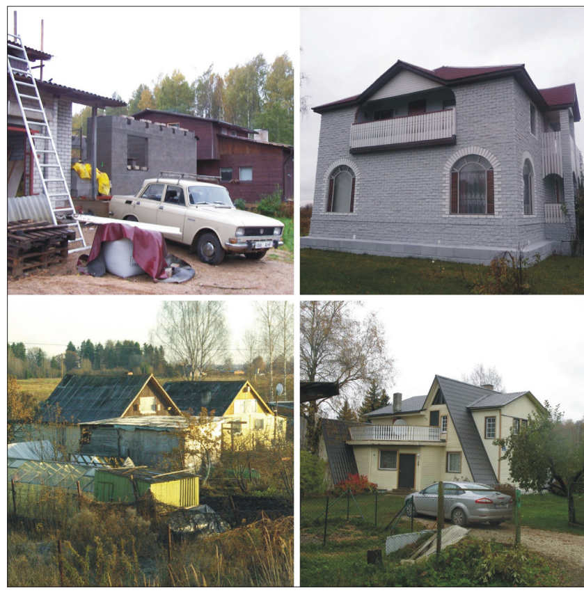
Fig. 2: Examples of the visual impressions from post-summurbia