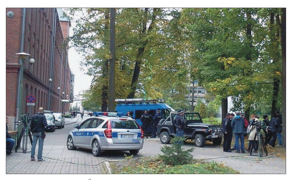
Fig. 4: The making of Komisarz Alex, 4th season.

Newsweek magazine (Polish edition), the first episode of Komisarz Alex was watched by over five million viewers. In this way, the story about the adventures of a Łódź policeman helped by a dog beats popular shows presented on other TV channels at the same time: X factor and Battle of the Voices (Szadkowska, 2012).