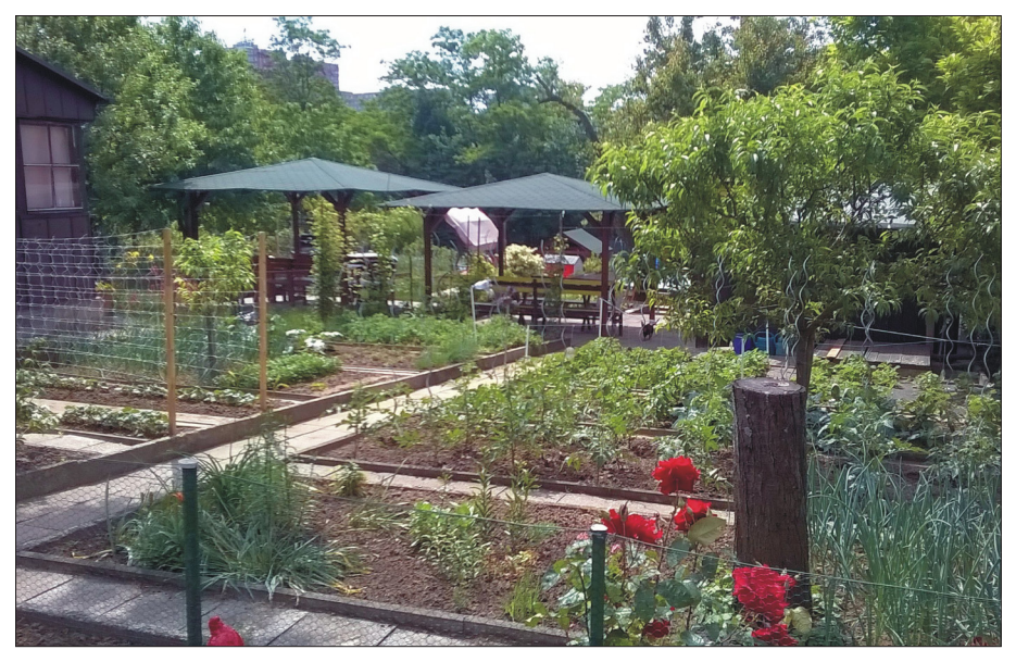
Fig. 6: Most plots in the studied areas combined productive, ornamental and recreational elements

The construction of the value of home-grown food, however, seems to go beyond its sensory qualities and into more embodied and affective realms (McClintock, 2010; Pottinger, 2017). The fact that gardeners interact with produce by investing their time, skill sets and physical work in it is – at least for some of our communication partners – not only a guarantee of the transparent origin of their food, but a value in itself. As one of the gardeners put it: "it makes one feel better, to have one's own." Similarly, our informants' criticism of conventional produce was not only concerned with the use of pesticides and fertilisers, but it also reflected a sense of alienation from more traditional ways of food production and a criticism of 'over-technologisation': "If you look at the mass-production sites... What you buy in the