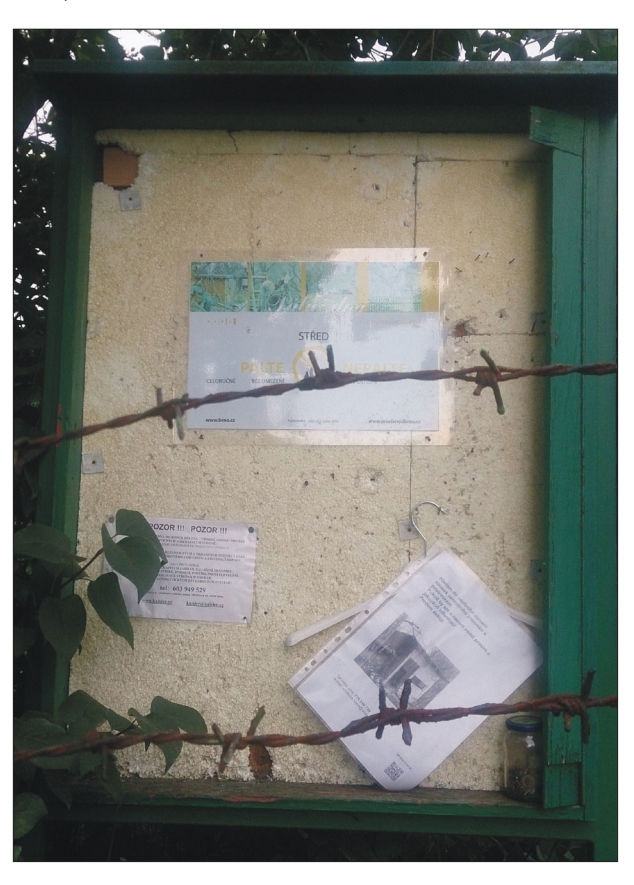
Fig. 4: Notice boards still play an important role in internal communications in allotment gardens

public paths by locked passages that prevent public use (see Fig. 5). Thus, the allotments are attractive areas for public recreation, and the proximity of forests, local hiking trails and natural sites near some of the researched sites (which add to their non-urban character) make them even more appealing. The gardeners do wish to keep a certain level of privacy and security, however, which can be interpreted as a sign of the privatisation of these spaces (for a more nuanced discussion of a similar situation, see Koopmans et al., 2017).