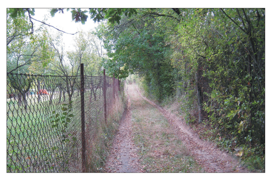
Fig. 5: The areas around allotments are used for walks, but the gardens themselves are closed to the public