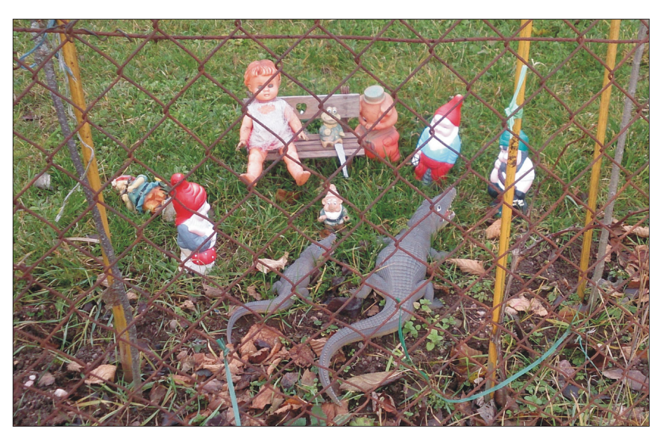
Fig. 3: Peculiar garden decorations are typical of the eclectic aesthetics of the allotments.

Appearance was a major point of criticism in some recent discussions about the future of Czech allotments. As documented by Kožešník (2018) and Gibas (2011), respectively, allotments were said to "resemble slums" or to be "ulcers on the face of the city". An official report on allotments commissioned by the municipality of Brno refers to compost heaps, a common part of the gardens, as "controversial (...) little waste dumps" (Ageris, 2006). These criticisms reveal a perception of the allotments as aesthetically inappropriate for the city, in other words, nonurban. Such argumentation is neither new, nor specific to the Czech Republic: for example, Borčić et al. (2015, p. 53) explain that during state socialism, Zagreb's illegal urban gardens were in stark contrast with its newly-constructed buildings, and thus, they also constituted a discursive opposite to the ideas of (socialist) modernity. Similarly, Djokić et al. (2017) state that although modernist planning visions