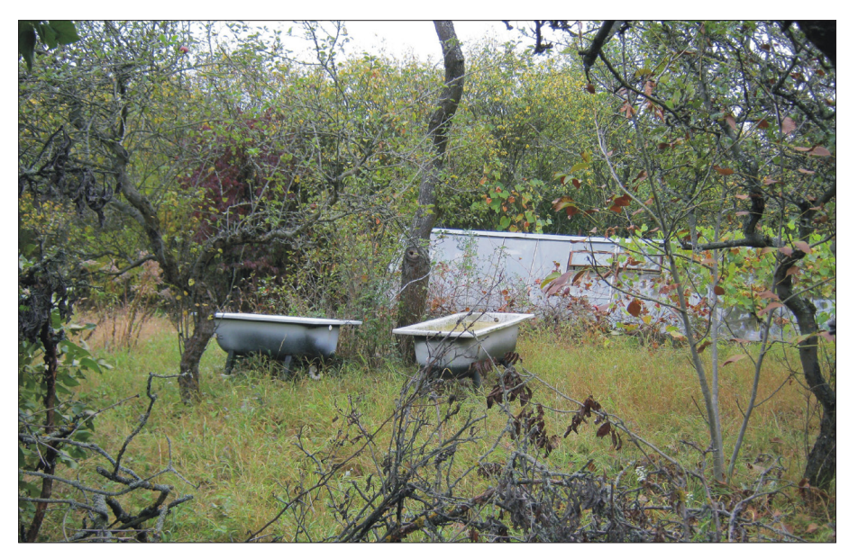
Fig. 2: Old bathtubs used for rainwater harvesting – similar DIY improvements can be both practical and picturesque, but they do not fit the image of neatly-maintained urban gardens