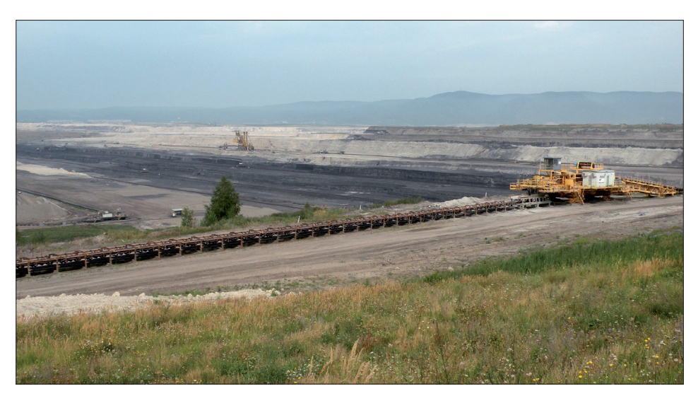
Fig. 3: One of the extensive open-cast coal mines that have reshaped the landscape near city of Most, Czech Republic in 2012.