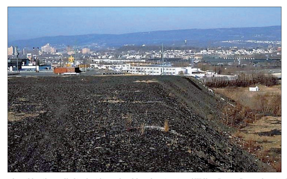
Fig. 1: Noncombustible piles, called 'culm,' litter the old anthracite city of Wilkes-Barre, Pennsylvania, USA

But these activities were only partially responsible for the landscape changes that resulted. In addition to the direct impacts of the mines, workers by the thousands moved to where the jobs were and built houses, churches, shops, and factories. It was a sequence replicated everywhere coal was developed, and settlement patterns created during this period are still largely in place, even when coal reserves have been exhausted. Coal mining and environmental quality became a classic binary that set a pattern for what we continue to see today. With little understanding of how to soften the impacts of the coal, damaged landscapes that coal mining created were tolerated as a sign of progress. For those who lived amid the coal measures, there was no escaping the energy landscapes that mining coal produced. Central England, South Wales, eastern Belgium, the Ruhr and Saar regions of Germany, Appalachia in North America, the Donets Basin of Ukraine, and many other places became sordid, unsafe, and pathetic energy landscapes that included scars, pits, shafts, piles of waste, hulking machinery, and miserable assemblages of squalid housing. So notorious did coal landscapes become in Britain