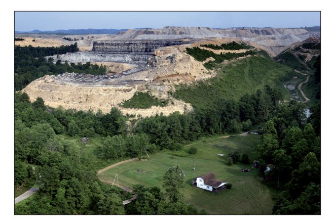
Fig. 5: Mountain-top removal in Hobert 21 mine, West Virginia, USA.

Fig. 5); up to 500 mountains in Appalachia have been lost so far. In the roughly 12-million-acre region of eastern Kentucky, southern West Virginia, western Virginia, and eastern Tennessee where mountaintop removal mining is concentrated, nearly 7% of all the land was disturbed between 1992 and 2012. For further information on mountaintop removal see Mary Anne Hitt (2007). One of many organisations that is attempting to slow the creation of energy landscapes from mountaintop removal is the National Memorial for the Mountains (www. ilovemountains.org).