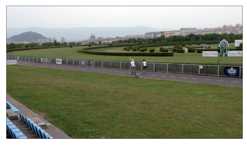
Fig. 9: Most Hippodrome – the racecourse with trail for in-line skating which was built on a recultivated coal dump, city of Most, Czech Republic.

Geographers contribute to understanding energy transitions by paying attention to settings (places), spatial configurations and the dynamics of the networks within which the transitions are embedded (Hansen and Coenen, 2015; Bridge and Gailing, 2020; Coenen et al., 2021). Since the capacity to take up different renewable energy technologies is related to geographical conditions, the locations, landscapes and territorialisations associated with energy transition can generate new patterns of uneven development (cf. Bridge et al., 2013). It is also important to understand how systems of places shape the reproduction of dominant socio-technical systems for energy (based on fossil fuels), by mediating the extent and efficacy of public engagement in decision-making and problematising political challenges to the social order (Cowell, 2020).