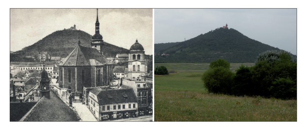
Fig. 4: Historic Most in 1940s (left) and the same perspective in 2012, showing reclaimed land after coal mining (right).