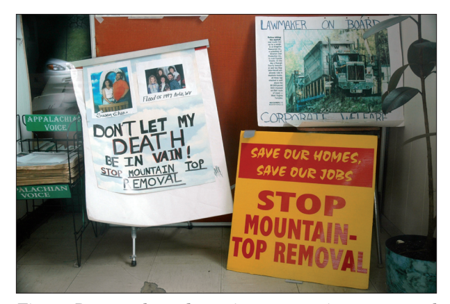
Fig. 6: Protest placards against mountain-top removal in July 2005, Whitesville, West Virginia, USA

Cataloging coal landscapes can go on and on. It could consider much more than just the extraction phase. We could also include landscapes that are altered by railroads and conveyor belts, storage silos, washing apparatus, power plants, fly ash disposal, and even the indirect impacts of acid rain on