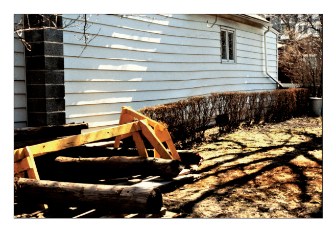
Fig. 2: Abandoned house damaged by subsidence from underground coal mines in Wilkes Barre, Pennsylavia, USA.

Most recently, especially in the Appalachian Mountains of the U.S., entire mountains are being demolished with nonchalant detachment (see e.g. Scott, 2010). Mountains in places like West Virginia are simply disappearing (see