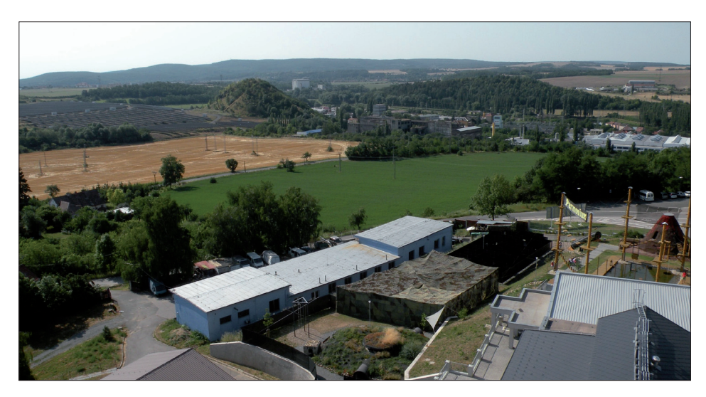
Fig. 7: Partially recycled coal energy landscape in Oslavany town (Czech Republic). An abandoned complex of coalfired power plant (in the middle of the background), a big slag heap accumulated over decades of burning coal, and solar (PV) plant constructed on mining dump (left) – photographed from the Kukla mining tower, which is part of the former mining buildings regenerated into an amusement park for children (in the foreground).

have been introduced by energy companies and various interest groups in order to influence policy makers, energy policies and their support among the general public, social acceptance of energy projects, and even customer loyalty in liberalised residential energy markets (Frantál and Urbánková, 2017). For example, the Czech Coal Group company has been organising since 2009 so called "Coal Safari" guided off-road truck tours in an area of active open-pit mine near the city of Most, which has been already attended by tens of thousands of visitors. The aim of the tours, which include several stops introducing different types of minescapes, mining technologies and machines in regular operation, with examples of post-mining environmental restoration (including the Most Hippodrome (Fig. 9), the Matylda recreational lake created from a flooded quarry, vineyards and forests planted on coal dumps), was to improve the public image of coal mining in favour of lifting the current territorial limits on mining in the area (see also Frantál, 2016). How are global discourses concerning energy sustainability locally reproduced through specific energy tourism products and how are different narratives used by companies and operators to promote their products and to shape public opinion about energy are among the key questions in the energy tourism research.