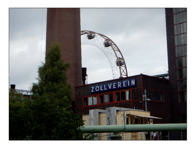
Fig. 8: Zollverein coal mine industrial complex (Essen, Germany) converted to museum and tourist attraction

Energy has been largely "invisible" in the consumption choices made in our daily lives, and people living outside energy landscapes were rarely aware of the spatial and environmental costs of the energy they consume (Pasqualetti, 2000). As Frantál and Urbánková (2017) suggest, the energy tourism can play a more important role than as just a kind of consumer experience-oriented industrial tourism (Mitchel and Orwig, 2002). By witnessing the real impacts of energy production on landscapes, energy tourism has the potential to improve people's energy literacy by raising awareness about the environmental cost of the energy we all use, and to motivate people to think about appropriate energy-related choices to tackle current energy challenges. While industrial heritage sites represent rather landscapes of history and nostalgia, new energy tourism sites with wind and solar farms represent authentic contemporaneity, or even the landscapes of a possible future, as we can assume further spatial diffusion of renewables. Energy landscapes